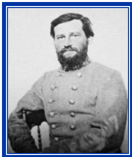
Lt. General Stephen Dill Lee, Commander United Confederate Veterans New Orleans, Louisiana, April 25, 1906.

"Remember, it is your duty to see that the true history of the South is presented to future generations."