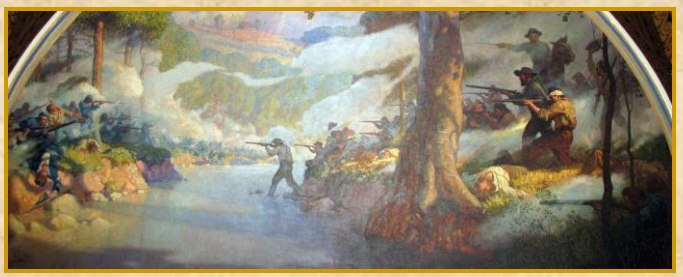
BATTLE OF WILSON'S CREEK