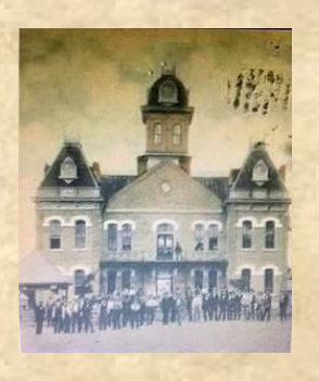
Upshur County Courthouse 1909

In 1901 the Texas Southern Railroad began to build through the East Texas area, and by 1902 it passed through Gilmer to connect Marshall and Winnsboro. After 1909 the line was acquired by the Marshall and East Texas Railroad, dubbed the "Misery and Eternal Torment" line by local wags. The railroad opened the virgin forests in the western part of the county to lumbering operations, and from 1907 to 1917 the county experienced a lumbering boom, especially around Rhonesboro and Rosewood. The last of the virgin forests were cut down during this period.