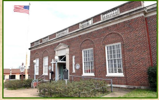
Thank you to the Historic Upshur Museum for providing our meeting location.

Upcoming Events may be found on the Calendar at: <a href="https://www.upshurpatriots.org">www.upshurpatriots.org</a>