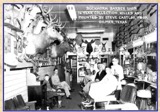
BUCKHORN BARBER SHOP GILMER TEXAS

The Confederate veterans of Thompson's Station knew that they had just won a striking victory.